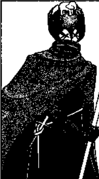
J Ind r

Ranks : Command 20 (50) Agent 40 Emissary 0 Mage 40 Health 100 Stealth 30 Challenge 82 Artifacts : #56 Helm of the Mûmak-king #104 Dawnsword√ #109 Cloud Bow Spells (+0) : #106 Deflections(90) #232 Fire Bolts(50) #302 Long Stride(71) #410 Divine Allegiance Forces(82)