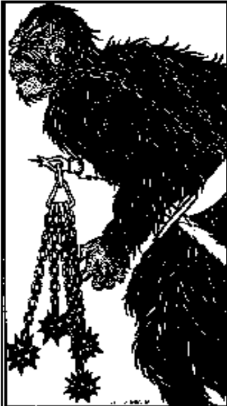
Araud g l

Ranks : Command 40 Agent 0 Emissary 0 Mage 0 Health 100 Stealth 20 Challenge 40 Artifacts : None Spells (+0) : None